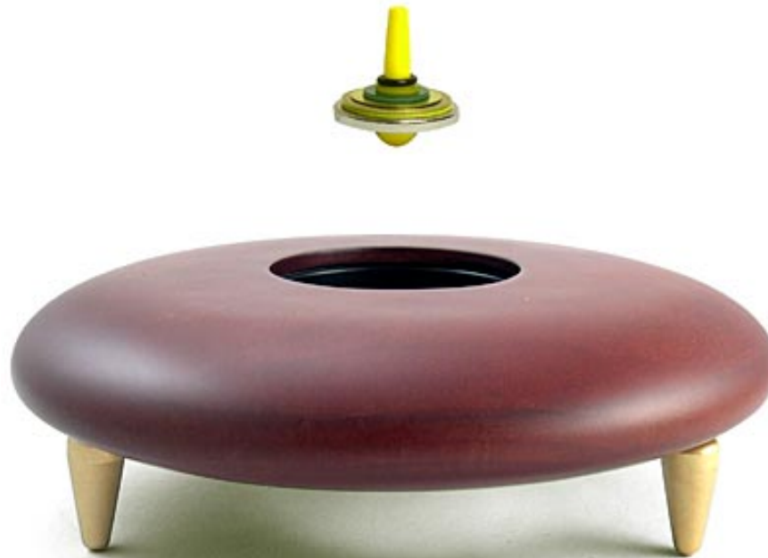
Levitron Cherry Wood