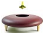
Levitron Cherry Wood